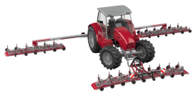
Cost efficient high capacity mowing for larger operations