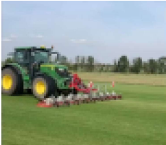
Modern lightweight decks uniquely designed