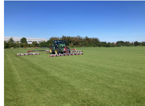
Efficient and quieter mowing, saving valuable fuel and time